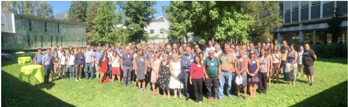
Photo 1: The participants of the general assembly outside the conference venue in Grenoble.

The 19th General Assembly of the World Earthquake GEodesy Network for Environmental Hazard Research (WEGENER), on earth deformation and the study of earthquakes using geodesy and geodynamics, was held at the Site Bergès - CRAYA Amphitheatre in Grenoble University in Grenoble, France, from 10-13 September 2018.