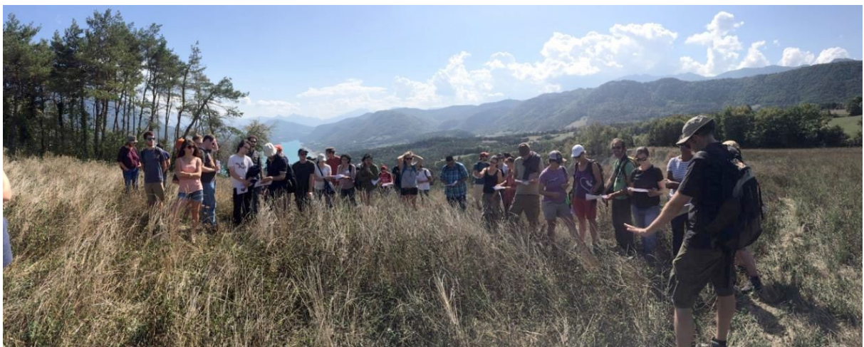
Photos 6 and 7: Visiting the active landslide of l’Harmalière at Trièves area of the field trip 13 September 2018.

The 19th general assembly has been sponsored by the International Union of Geodesy and Geophysics, the International Association of Geodesy, the Observatoire des Sciences de l’Univers de Grenoble, University Grenoble Alpes, and Institut d’ingénierie Univ. Grenoble Alpes.