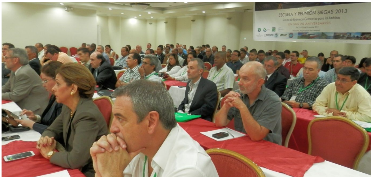
Attendees of the School on Reference Systems, Crustal Deformation and Ionosphere Monitoring. Panama City, Panama, October 21 to 23, 2013.